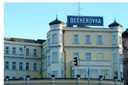
Jan Becher – Karlovarská Becherovka a.s. belongs to the international company Pernod Ricard.

spol s.r.o. installed a SecuriPro® system and a SecuriRas® ASD 516 aspiration smoke detector system in the historical buildings used for production and administration. The warehouses are protected by several SecuriSens® ADW 511 Transafe linear heat detectors. These installations ensure that any fires are detected quickly, safely and reliably. ■